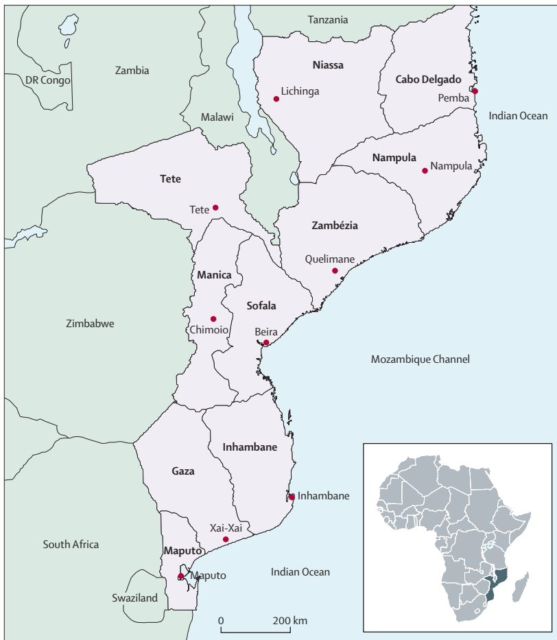
Figure 1: Political map of provinces and provincial capital cities of Mozambique

disorders (6%), malaria (6%), hypoxia and asphyxia (6%), and pneumonia (4%). 4 The Mozambican National Health Service is the primary provider of formal health services in the country, with more than 90% of the population outside of the capital city of Maputo seeking care from public-sector clinics. However, the system is understaffed and underfunded relative to the high burden of infectious and chronic diseases. Over the past decade, health-systems strengthening has been an important focus of efforts to achieve MDG 4, with particular attention paid to the role of human resources for health and the availability, access, and quality of safe delivery services. 5 Several studies have examined the relation between health-system factors and under-5 mortality in low-income and middle-income countries, but few to none (to our knowledge) have used longitudinal designs with data resolutions below the national level. 6–10