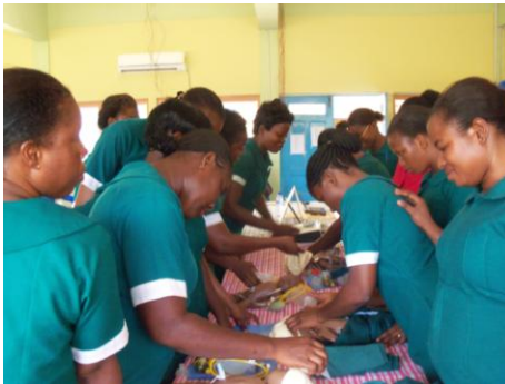
Student Midwives learning to Ventilate Dummy Newborns

The practice of training local practitioners in the ability to effectively teach neonatal resuscitation (NR) skills is crucial for the successful and sustainable training of future student midwives.